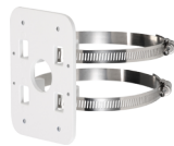
PFA152 Pole mount